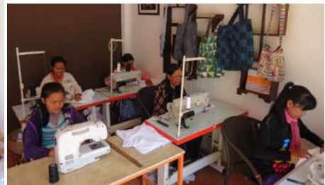
Above working with Spotlight's bags. Below bags for Angkor Photo Festival. They did so well!.