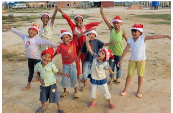
Merry Christmas and Happy New Year